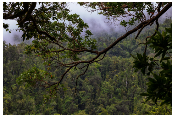
Pilot Whales are regularly seen in pods off of Dominica (photo © Ryan Chenery - Birding the Islands); Lesser Antillean Iguanas stalk through the branches of the mangroves that line the mysterious Indian River (photo © Faraaz Abdool - Birding the Islands); the ethereal cloud forests of Dominica are home to the majestic Imperial Amazon (photo © Faraaz Abdool - Birding the Islands)